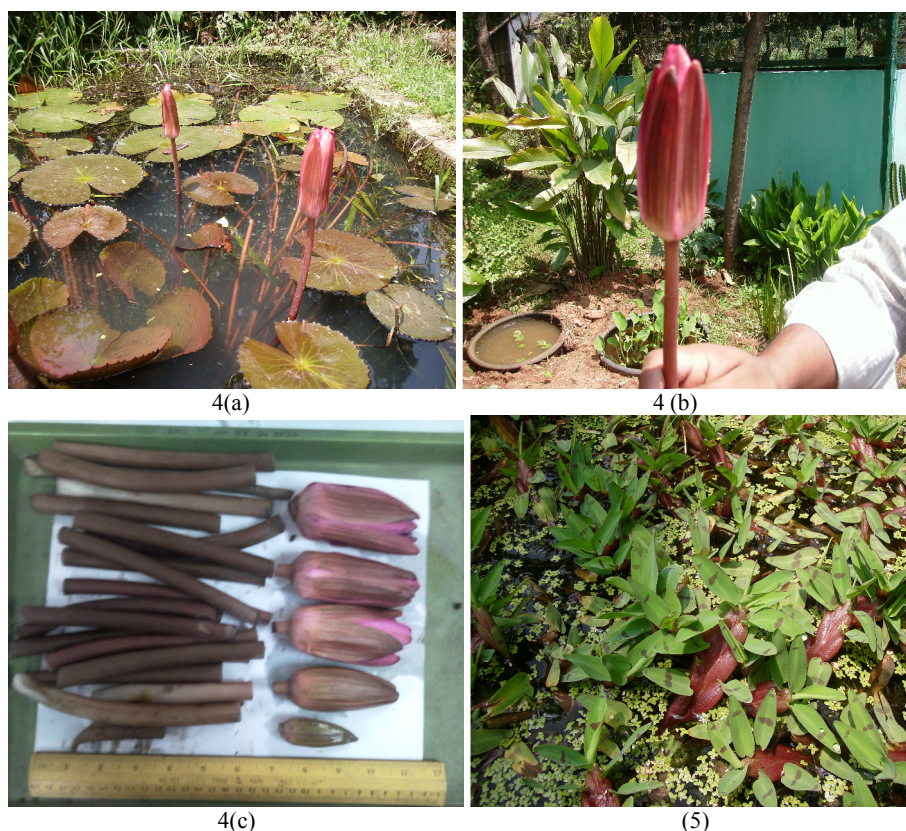
Figs 4a. Ex situ culture of Nymphaea nouchali in the culture pit. b. Red flower of Nymphaea nouchali with its long pedicel. c. Many small cut pieces of the pedicels of Nymphaea nouchali . 5. Ex situ culture of Hygroryza aristata in the culture pit.